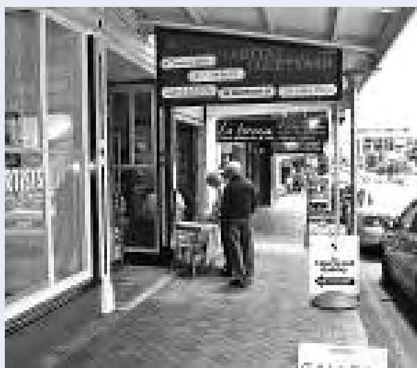
Last chance for shopping, in Auckland.

We really enjoyed being in New Zealand, and taking the cruise was a good way to see it. I was a little disappointed that we didn't spend more time in Australia, but maybe we can do that again.