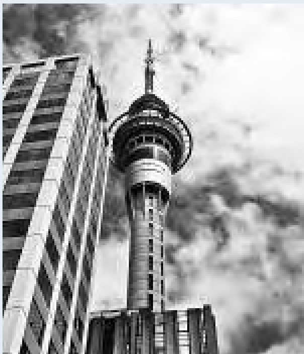
The Sky Tower in Auckland.

driving around the harbor area and then stopped at the Dove-Myer Robinson Park, which had a great lookout point. We then stopped at the Auckland Cathedral with its beautiful stained-glass windows. The wives wanted to do some last-minute shopping, so we stopped for lunch in Parnell, which had a lot of shops and art galleries.