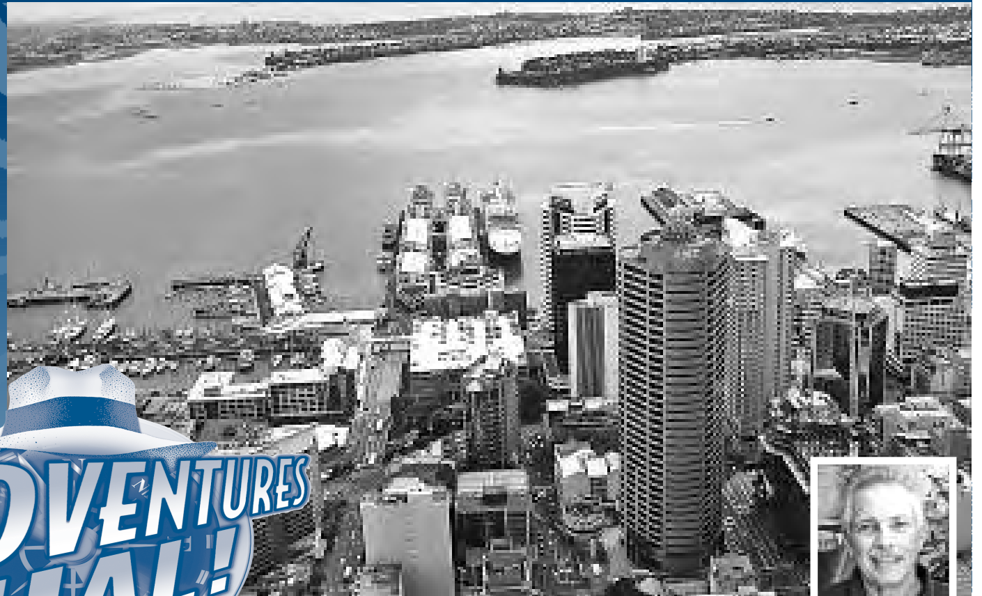
A view of the ship – and downtown Auckland – from the Sky Tower.