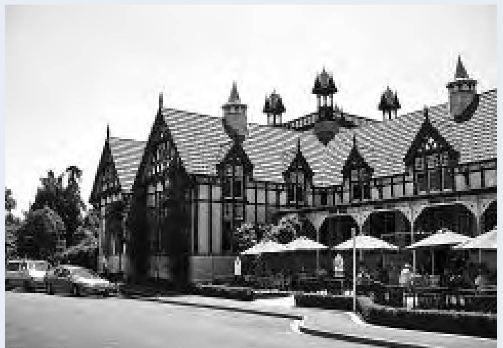
The Rotorua Museum.