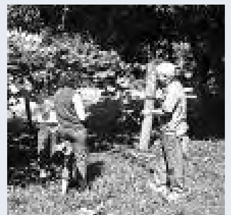
A kiwi farm.

Our last night on the ship was spent packing and saying goodbye to new friends we had met. In the morning we docked in downtown Auckland, the largest city in New Zealand. Getting off the ship was easy and, after passing through securities check, we hired a taxi to take the short ride to the Hyatt Regency Hotel. We had planned for an overnight stay and wanted to see as much of the area as we could before our plane left the next evening.