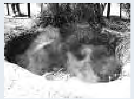
Looking at the steaming ground in Rotorua.