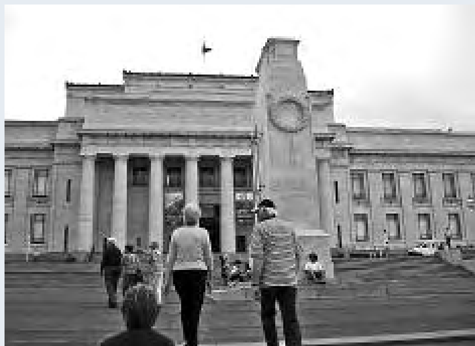
The Auckland Museum.