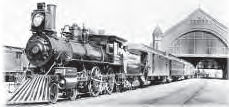
The Southern Pacific steam engine no. 1364 heads into the Arcade Station in Los Angeles, 1891.

■ Banning Residence Museum hosts summer-long exhibit on the Transcontinental Railroad.