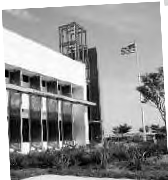
Los Angeles Fire Station 5 in Westchester/LAX.