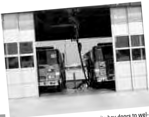
Los Angeles Fire Station 5 opens its bay doors to welcome guests to Fire Service Recognition Day.