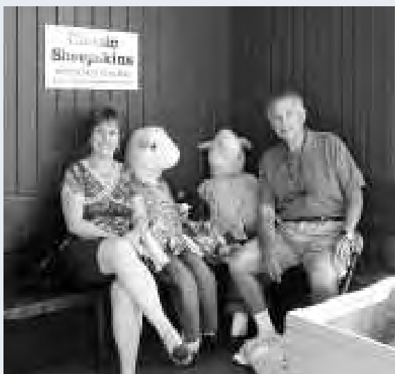
At the wool store in Napier.