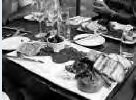
The great lunch at the winery.

Tomorrow we will be sea, before stopping at Tauranga, before we end our cruise in Auckland.