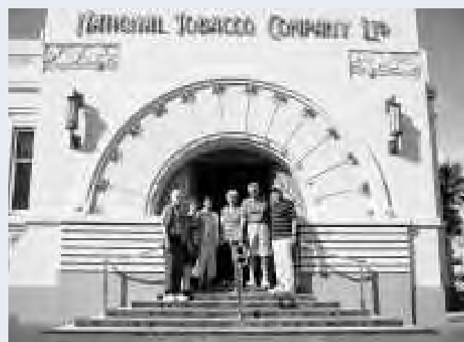
Art Deco style in Napier.

took the free shuttle bus. We met our guide, Nigel, at the information center and started with a drive around the surrounding area. The town sits at the end of Queen Charlotte Sound and reminded me of a small fishing village. The area has a number of hiking trails, called tracks, and attracts a large number of backpackers.