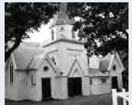
Old St. Paul's in Wellington.

We started our tour by going to the highest point, Brooklyn Hill, to see a wind turbine that are used to generate electricity for the city. The city's nickname is "Windy Wellington," and they take advantage of the wind with the turbines. There was no wind today, and we had a great view of the city and harbor areas. We drove back to the government area and stopped to see the Parliament buildings. We stopped at Old St Paul's, the former Cathedral Church. The foundation stone was laid in 1865, the year after