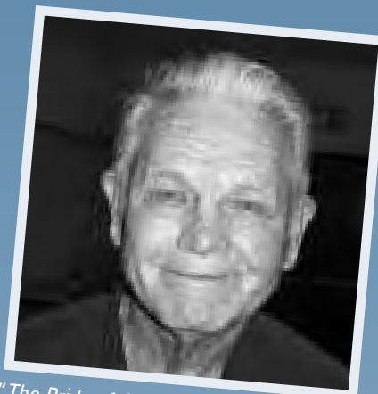
"The Pride of the Yankees, with Gary Cooper."