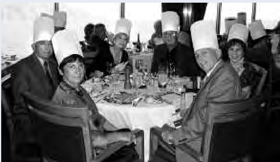
The Chef's Dinner on the ship.