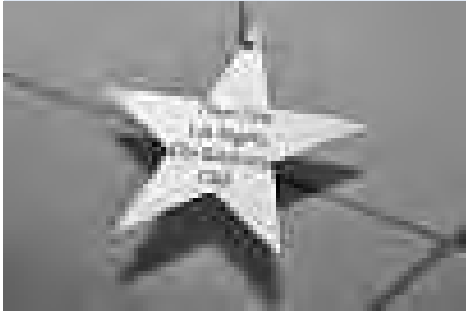
Thank you, Club star!