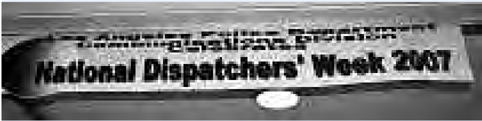
Welcome to National Dispatchers' Week Open House.

9-1-1 9-1-1 9-1-1 9-1-1 9-1-1 9-1-1 9-1-1 9-1-1 9-1-1 9-1-1 9-1-1 9-1-1