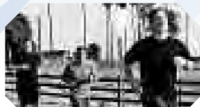
The palm trees will soon be replaced by desert.