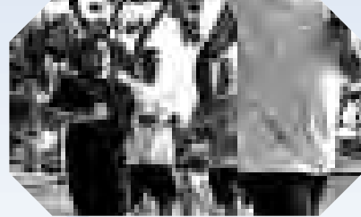
Off they go.