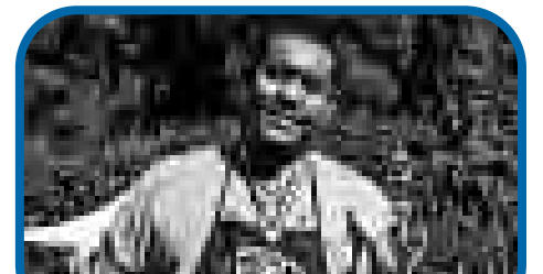
Master of the Grill