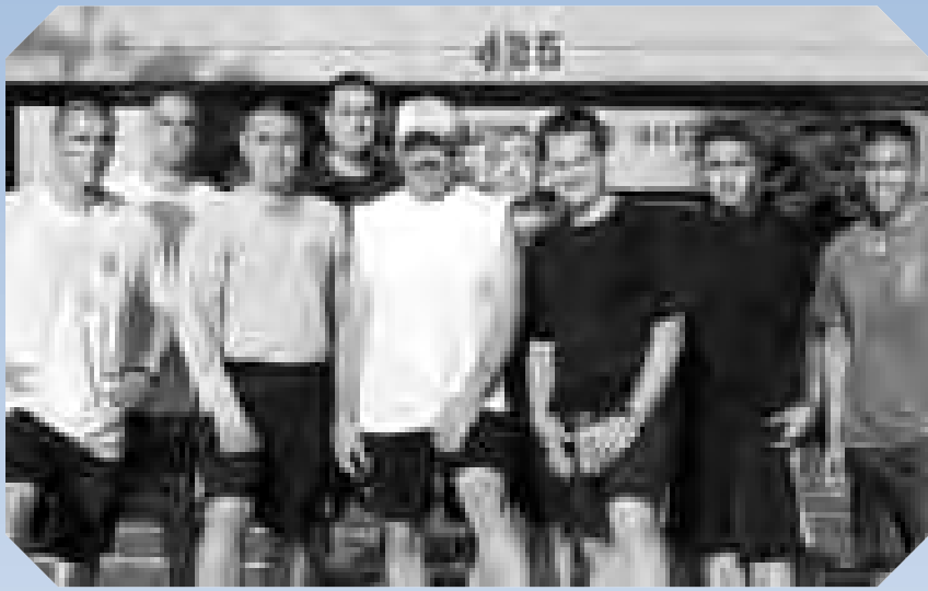
The first Port Police Baker to Vegas Team (not all pictured).