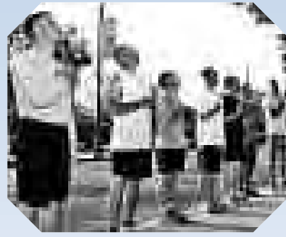
Runners recite the Pledge prior to their run.