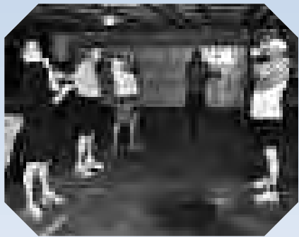
Runners stretch before their practice run.