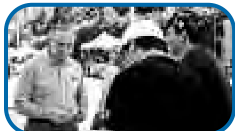
LAPD Chief William Bratton makes his way to the Hollenbeck booth.