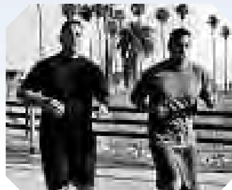
Team motto: "We run on water."