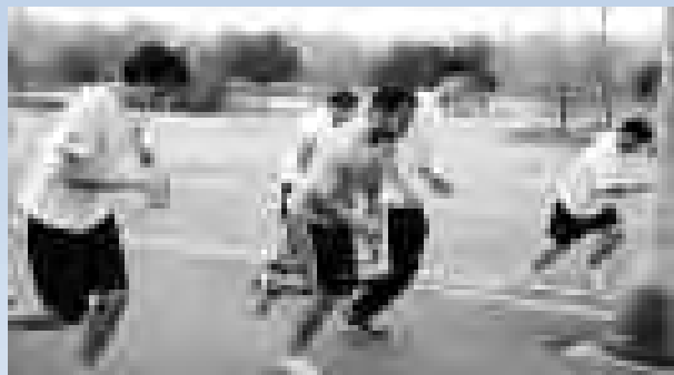
Off they go in preparation for the big race!