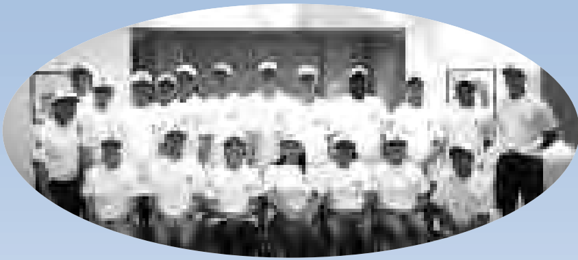
The LAPD Training Division Baker to Vegas Team.