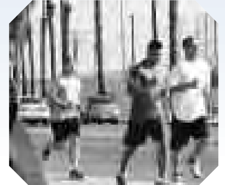
Runners make their run along the streets of San Pedro.