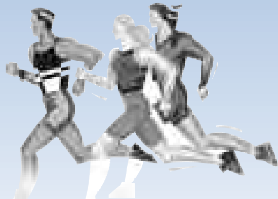
The annual Baker to Vegas foot race was created and is produced by the Los Angeles Police Revolver and Athletic Club (LAPRAAC). The Club is grateful for their leadership in this event.