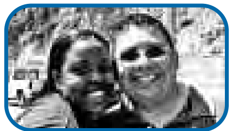
Are we having fun yet?!