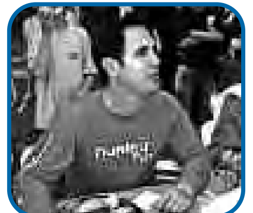
Actor Don Diamont enjoys his first sample.