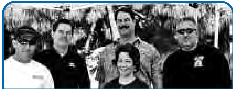
Club's Barbecue Choice Award