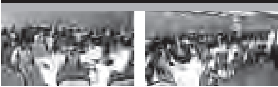
The third annual Healthy Relationships Conference, hosted by the Commission on the Status of Women.