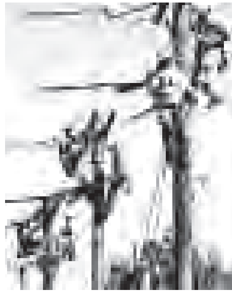
From past years, The events showcased safety techniques, skill, and the speed of power utility workers.