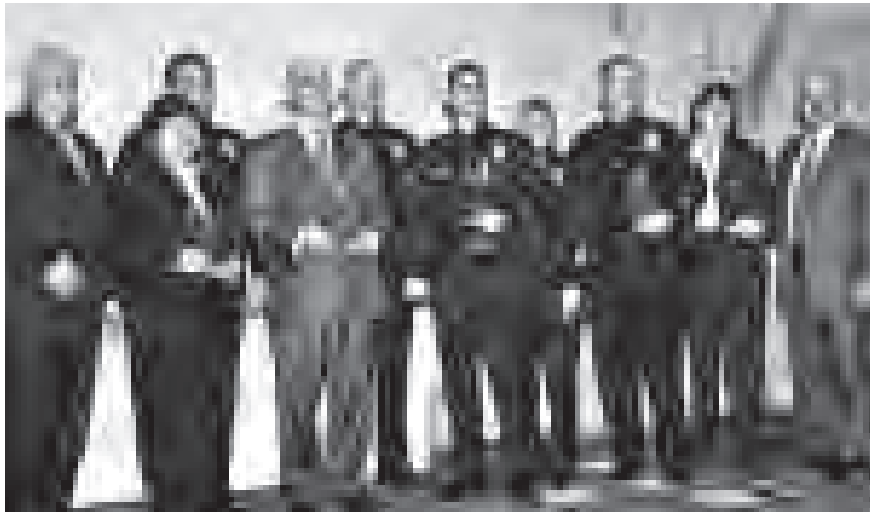
The five honorees at the Central City Police Boosters Recognition Day.