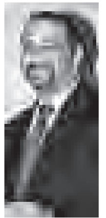
Keynote Speaker Arif Alikhan, Deputy Mayor in the Homeland Security and Public Safety Office of the Mayor Antonio R. Villaraigosa.