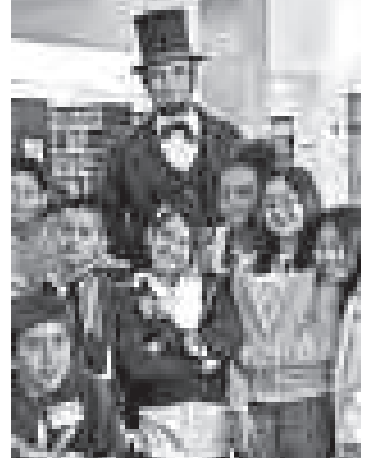
"Abraham Lincoln," pictured with some of the schoolchildren at the ceremony.

tipurpose meeting room, and two study rooms. It also provides 50 computers with access to the Internet and the library's full range of electronic resources. Also provided is a Computer Training Center for joint use with Narbonne High School.