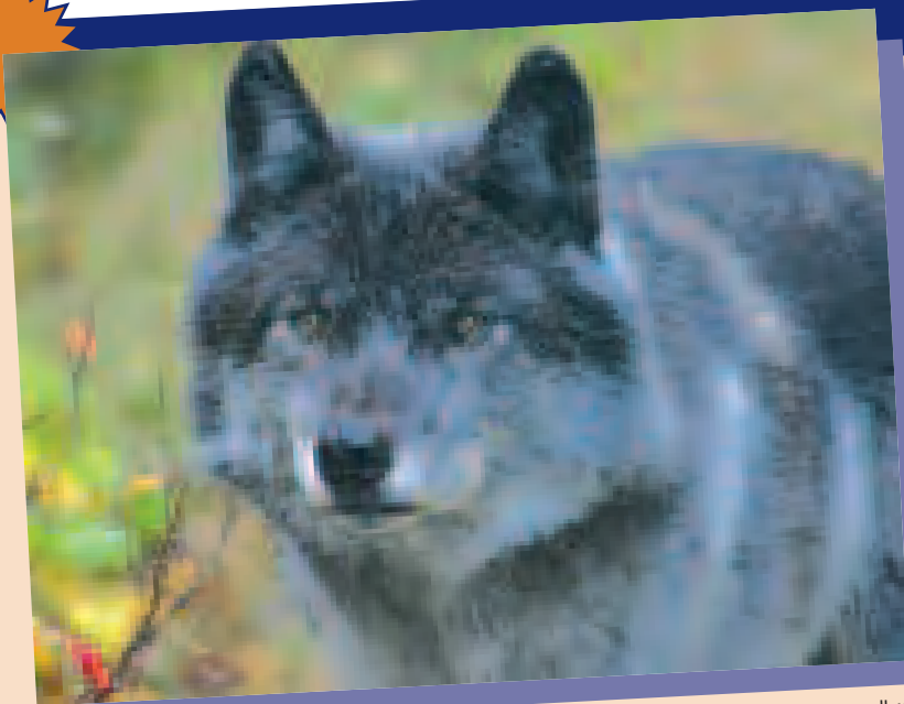
"This photo was taken by me with a digital camera on our trip to Canada. We paid to take a nature walk with wolves. The wolves are born in captivity, but they are still wolves. A little scary, especially when you sign the waiver that says they can attack and kill you and we are not responsible. But a great experience!"