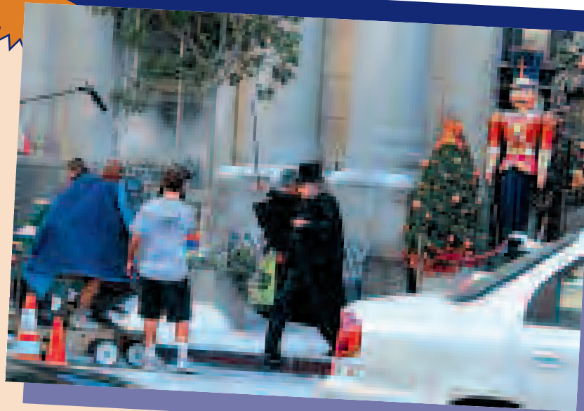
"This photo was taken just before Christmas at Fourth and Main Streets for a TV commercial. When I looked up, I saw Mr. Scrooge and I took his picture."