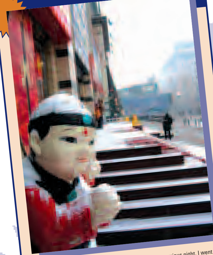
"It was the day after Christmas and it had snowed the previous night. I went outside for an early morning stroll along Wangfujing Street and captured a tranquil moment at what is normally a very busy tourist destination. It was so cold outside that it started to snow again. What an unforgettable experience: my first white Christmas!"