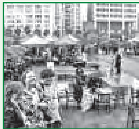
From last year: Pershing Square hosted its annual St. Patrick's Day party after the downtown parade March 17.

Information: (310) 537-4240, or www.pageantproductions.com