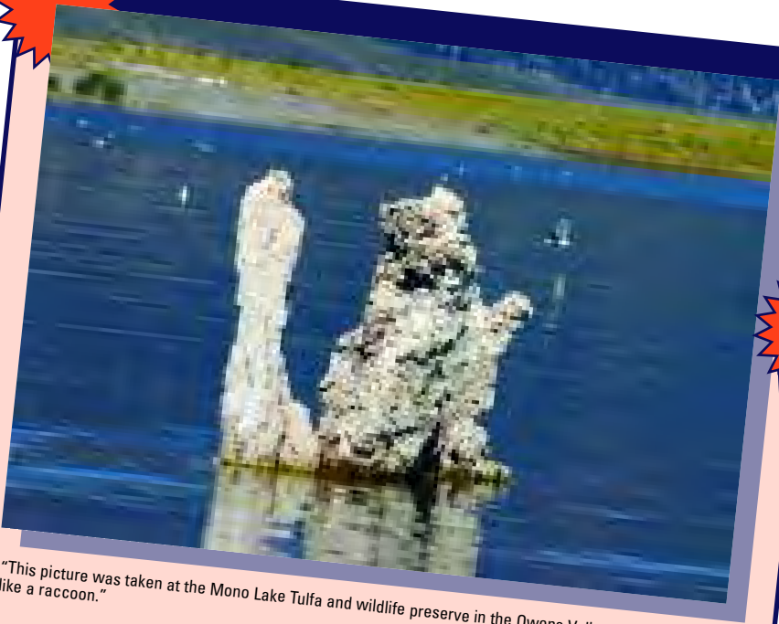
"This picture was taken at the Mono Lake Tulfa and wildlife preserve in the Owens Valley. It kind of looks like a raccoon."

NEXT DEADLINE: February 15 Happy Snapping!