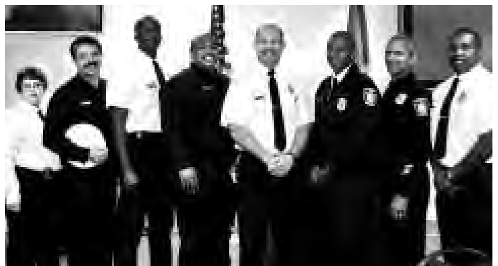
The Fire Safety Education Unit.

All of Your Family & Friends Can Now Join LAFCU Ask Us How!