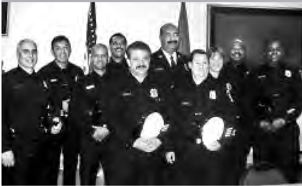
The Inspectors who were promoted at the ceremony.