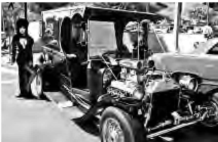
A 1923 Ford with Elvira, Mistress of the Dark.