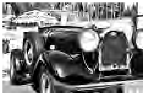
A 1927 Bugatti.