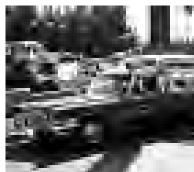
A 1970 emergency vehicle.