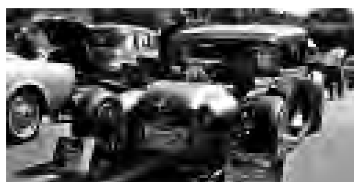
A 1930 Ford hot rod.