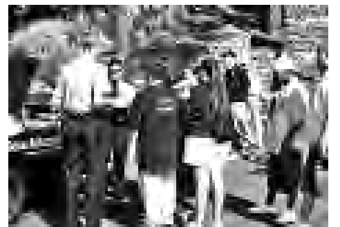
VIP (Visually Impaired Person) Judges judge strictly by feel and are not impressed by the expensive paint jobs.