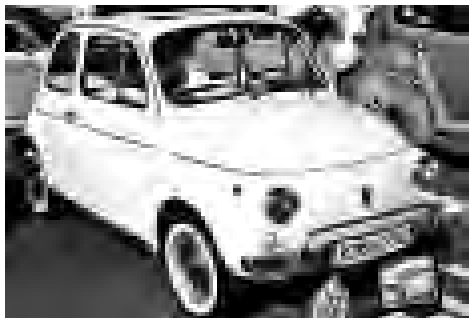
A 1969 Fiat was possibly the smallest car in the show.