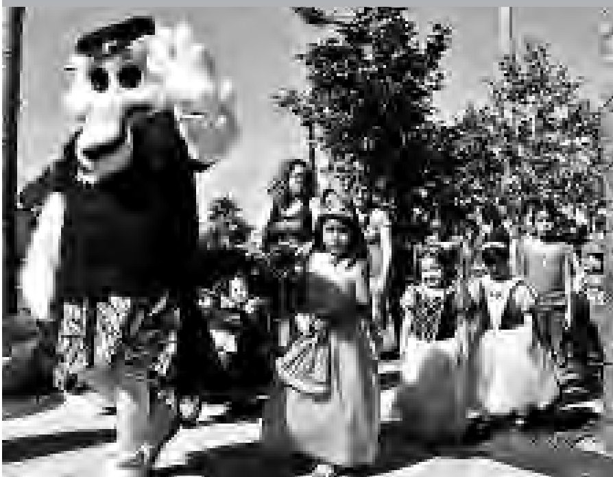
Pelican Pete leads the parade.