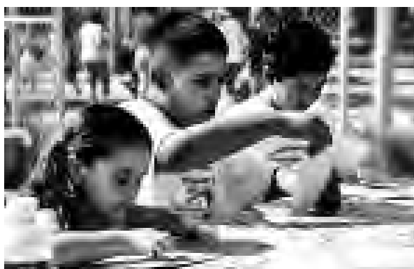
Harbor's Halloween party offered activities for everyone.