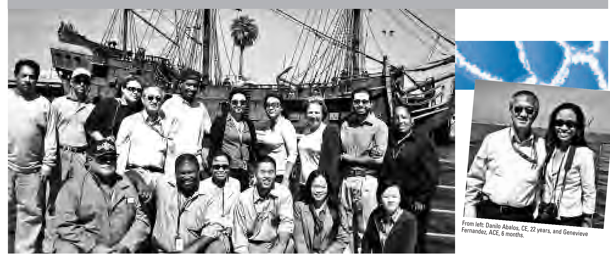
The Harbor's new employees pose together ... and will work together for the City's benefit.