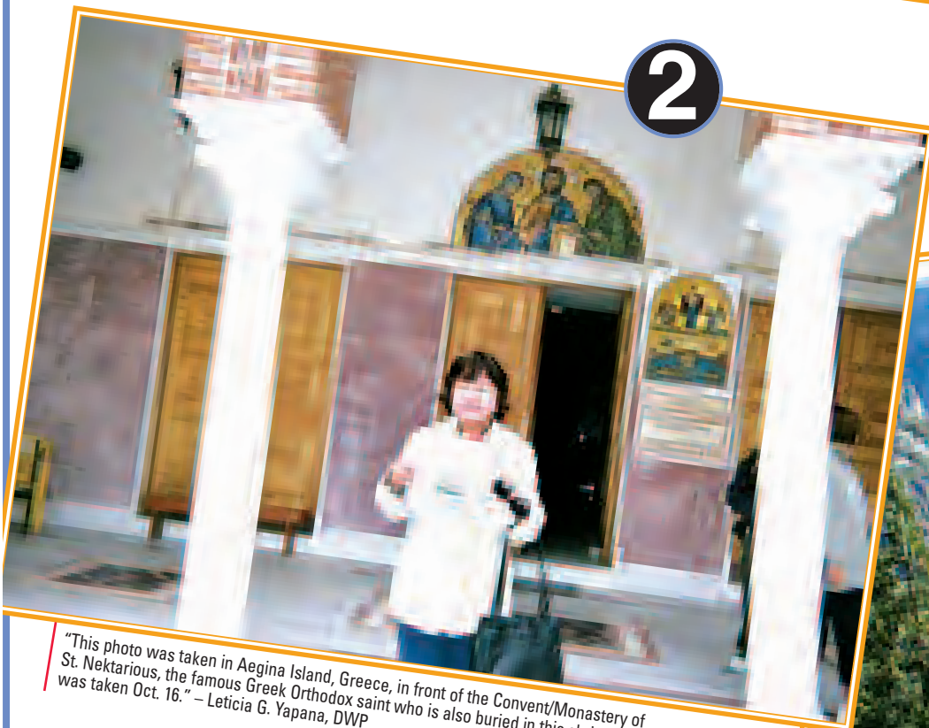
"This photo was taken in Aegina Island, Greece, in front of the Convent/Monastery of St. Nektarios, the famous Greek Orthodox saint who is also buried in this shrine. It was taken Oct. 16." – Leticia G. Yapano, DWP