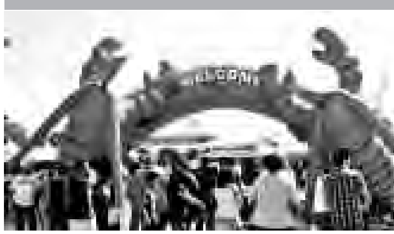
The Port's Lobster Festival 2006.