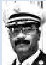
By Jimmy Hill, Fire Marshal, LAFD

The U.S. Fire Administration's formal release of an official report highlights the fact that nationwide, on an annual basis, candles are responsible for an estimated 23,600 residential structure fires and cause 1,525 civilian injuries, 165 fatalities and $390 million in direct property loss.