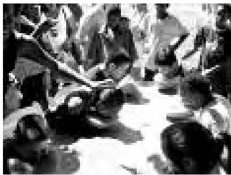
Children participated in the watermelon-eating contest.