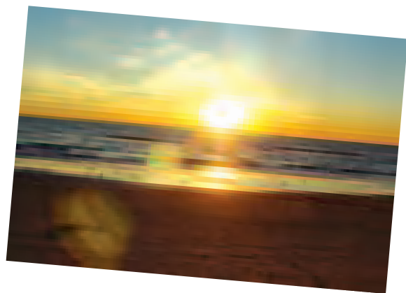
"Sunset in Oceanside, Calif."