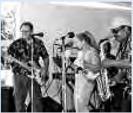
The Blues Shifters provided live entertainment.