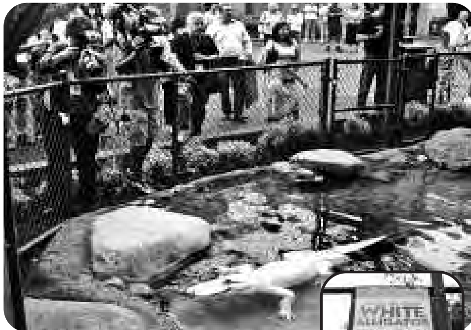
The rare white alligator in an exhibit was surrounded by photographers.