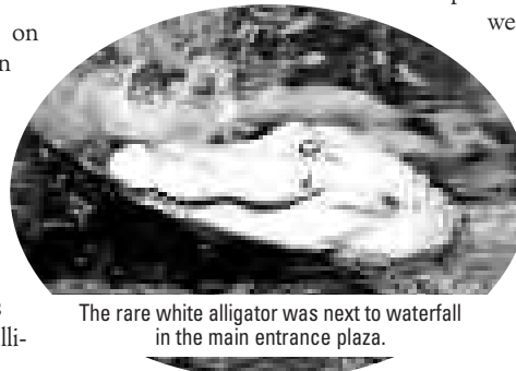
The rare white alligator was next to waterfall in the main entrance plaza.

In addition to the alligators, the Zoo's "Out of the Swamp" promotion highlighted other swamp species including river otters, spoonbills, ibis, cottonmouths as well as plants. Education stations taught children young and old about the importance of swamps. A special swamp scene with a realistic looking alligator provided a photo opportunity for zoo guests.