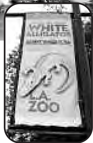
The White Alligator banner at the Los Angeles Zoo.