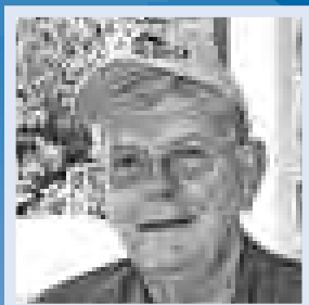
Snow White. - Clyde Reed

What is your most favorite movie of all time?