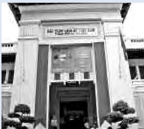
The National History Museum.

Next month I'll finish up our cruise with our stay in Bangkok.