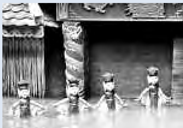
The Water Puppets.

Our last port of call before Bangkok was Singapore, just 85 miles north of the equator at the tip of the Malay Peninsula.