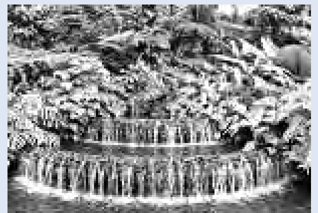
A fountain in the Garden.