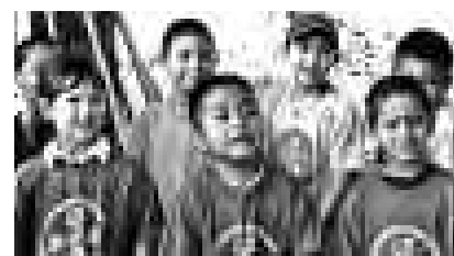
The Children of Evergreen Child Center sing a song for the audience.