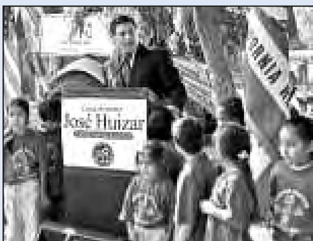
Page 12 Groundbreaking for Evergreen Child Care Center