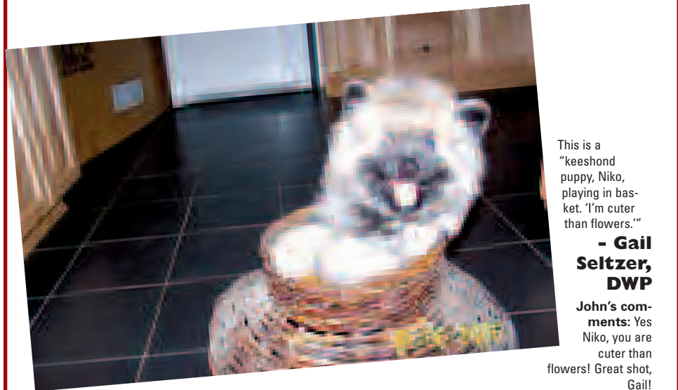
This is a "keeshond puppy, Niko, playing in basket. 'I'm cuter than flowers.'"