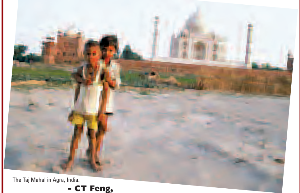
The Taj Mahal in Agra, India.