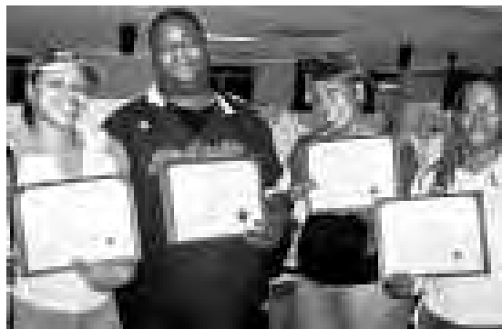
Third-place winners: HPV.