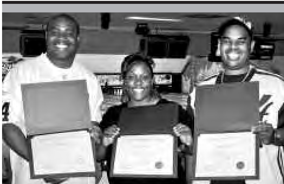
First-place winners: Hollywood Division.