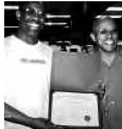
Second-place winners: Western Division.