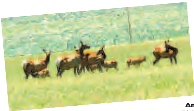
This is this year's newest calves and cows in Owens Valley.