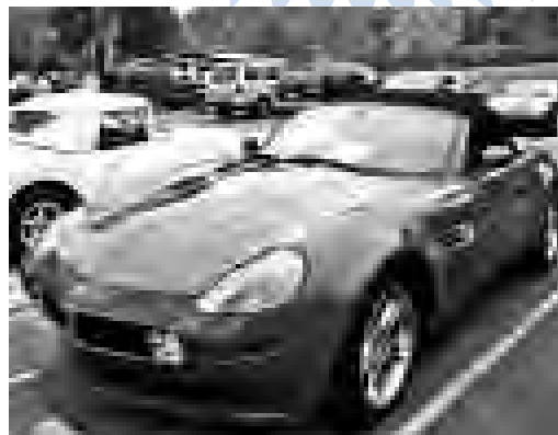
A 2004 BMW Z8 owned by Ara Sargsyan.