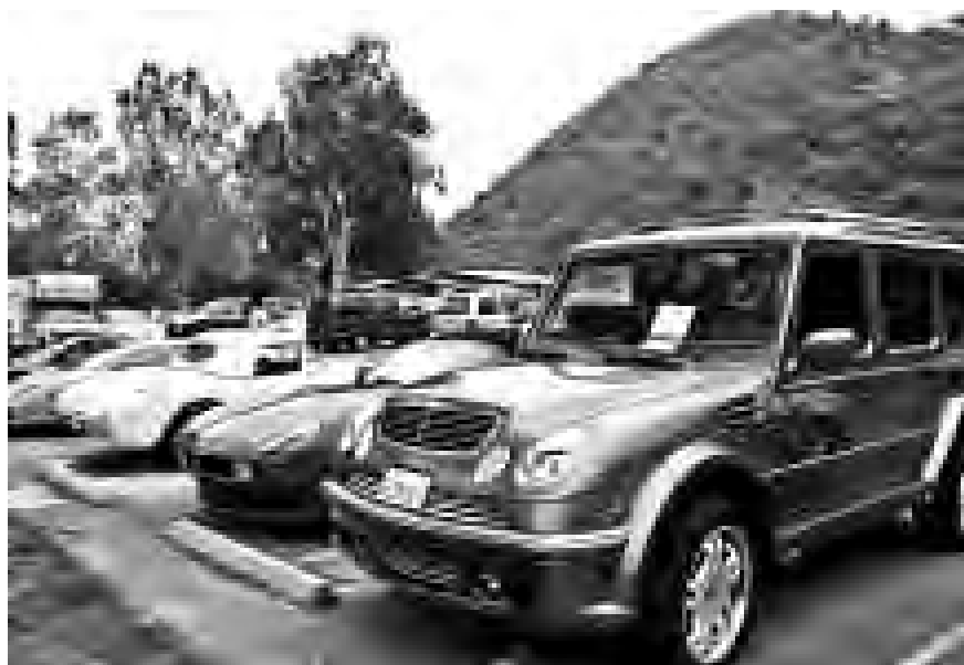
A glimpse of some of the cars lined up for judging.