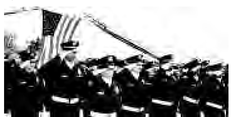
Los Angeles Airport Police Honor Guard Detail salute.