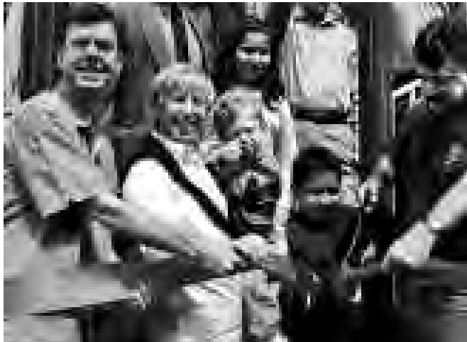
The ribbon is cut at the dedication ceremony of Little Landers Park.