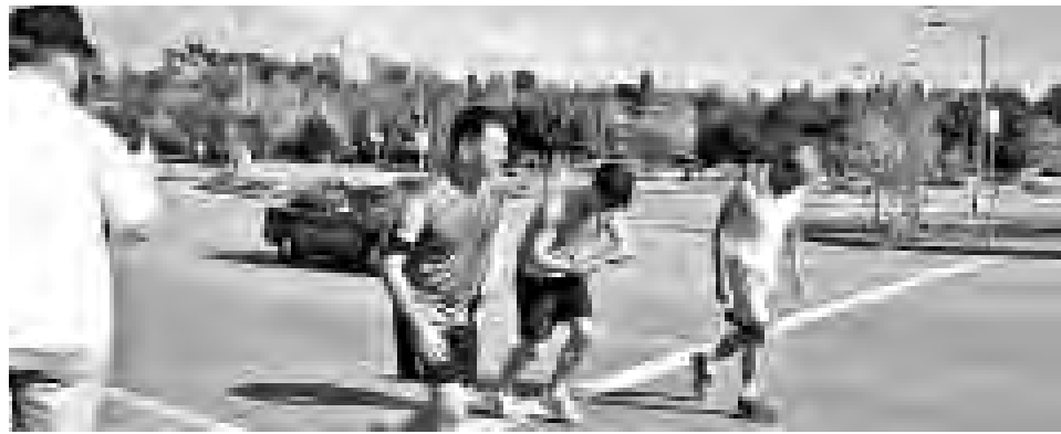
Visualize the finish line.