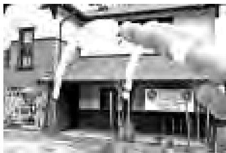
The New Fire Station 83.