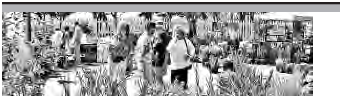
At last year's Point Fermin Garden Show, which benefits the facility.