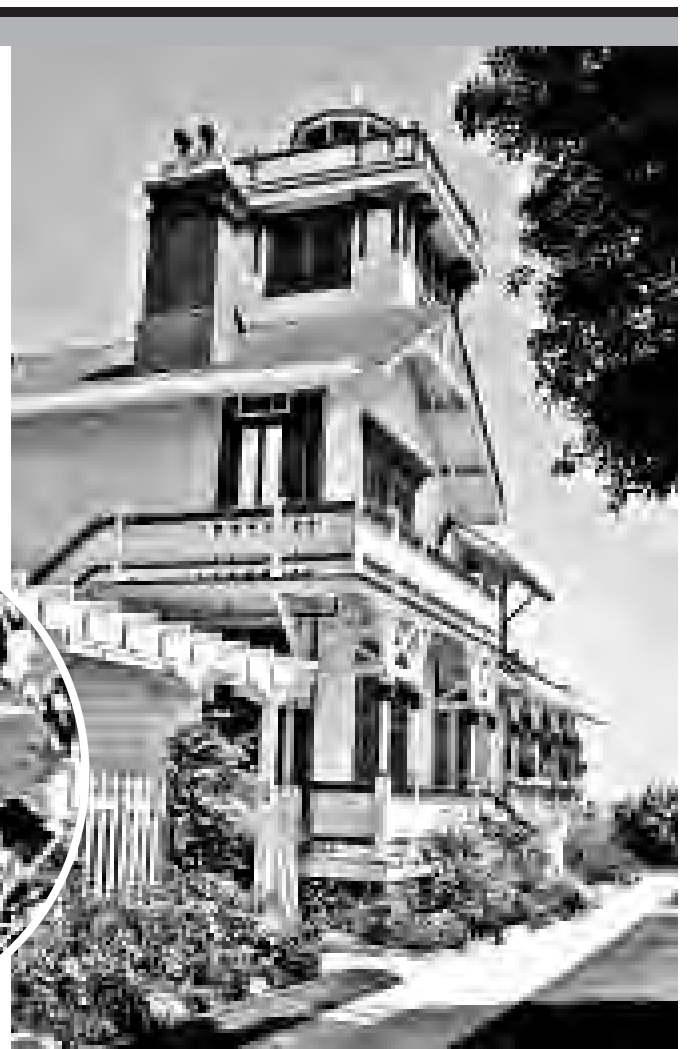
Point Fermin Lighthouse.