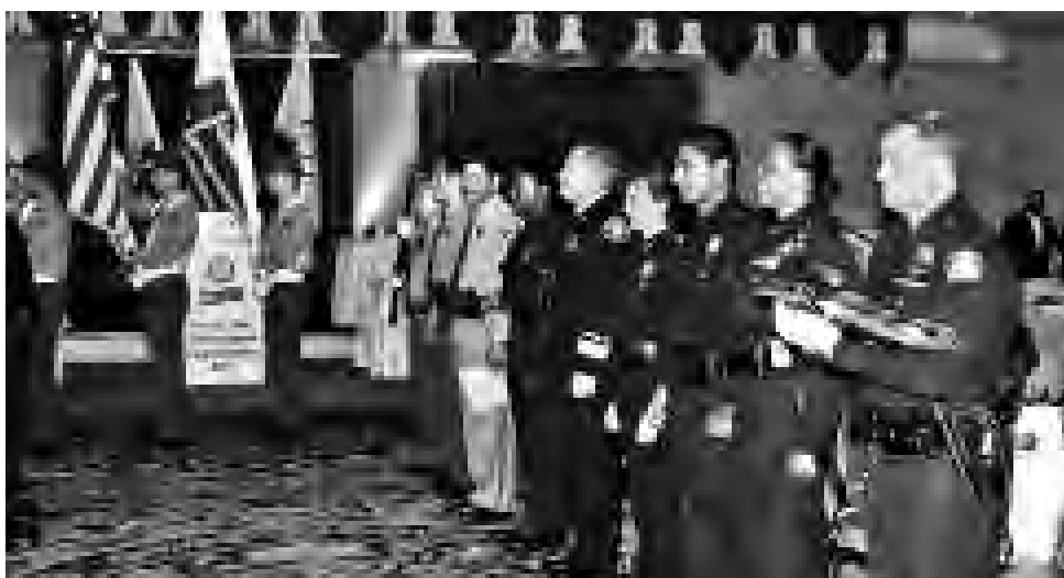
City and County officers line up to start the ceremonies.