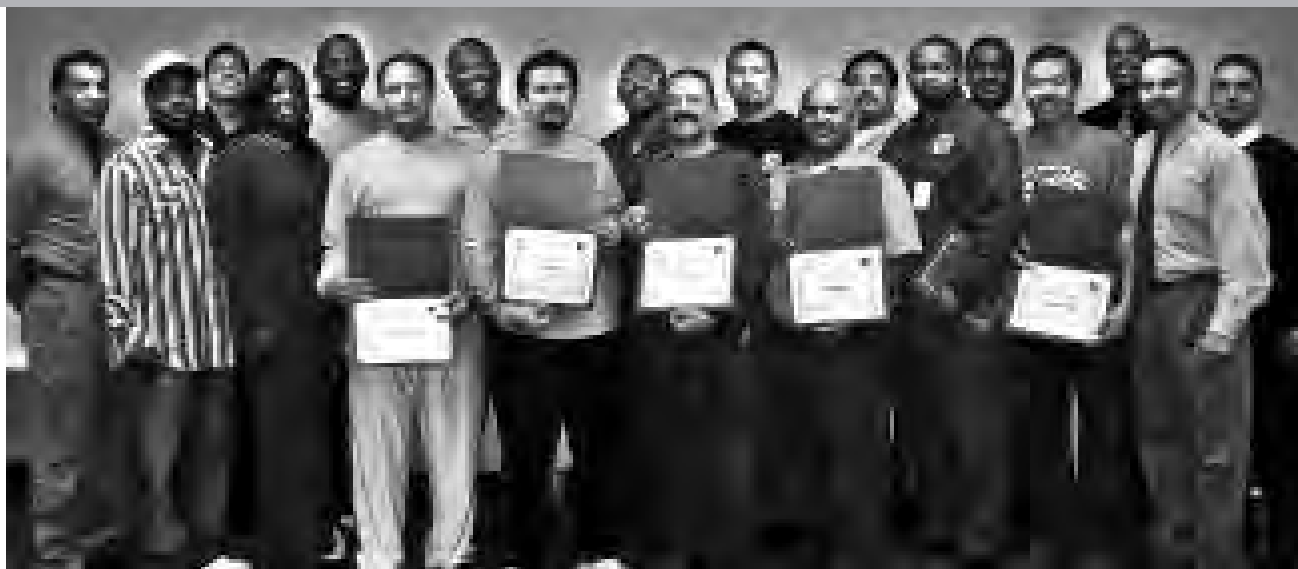
Participants of the Solid Waste Career Workshop.