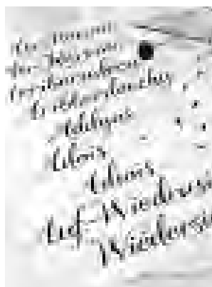
The card was signed by all.