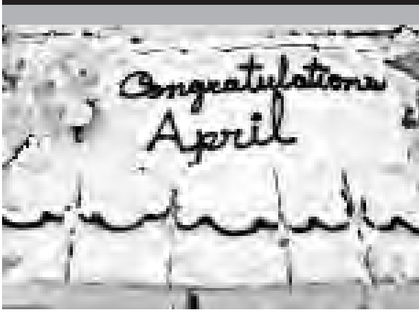
The "congratulations" cake.