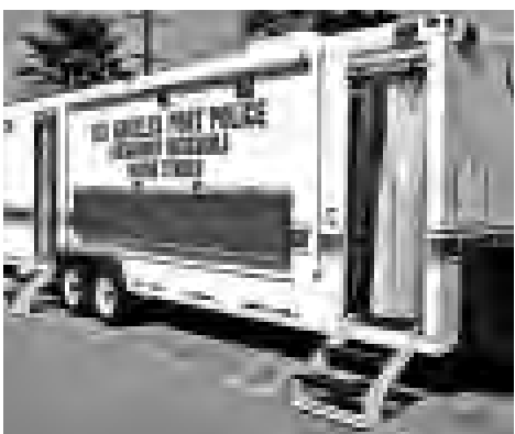
The "Decon Tender" is the decontamination equipment used to cleanse those who become contaminated.