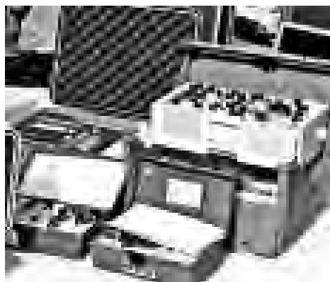
The Port's Hazmat unit put its top-of-the-line equipment on display.