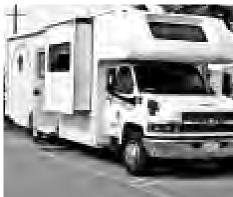
The Mobile Shelter, bought originally for relief of Hurricane Katrina in New Orleans, has now returned for use in the City.