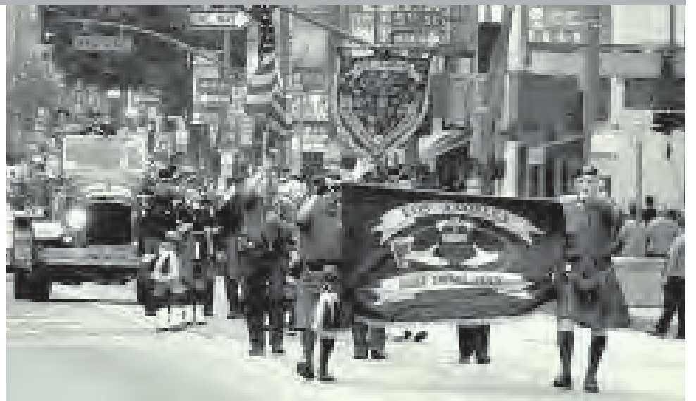
Above, last year's St. Patrick's Day parade. Left: Two of the Cleary Irish Dancers entertained as part of last year's St. Patrick's Day Party at Pershing Square.