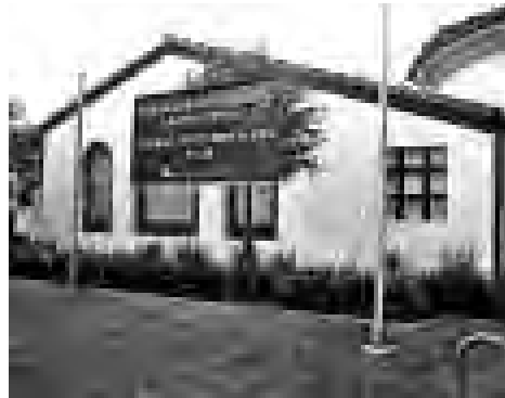
In front of the Fairfax Branch Library.