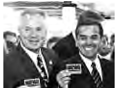
Councilman Tom LaBonge and Mayor Antonio Villaraigosa proudly display their library cards.