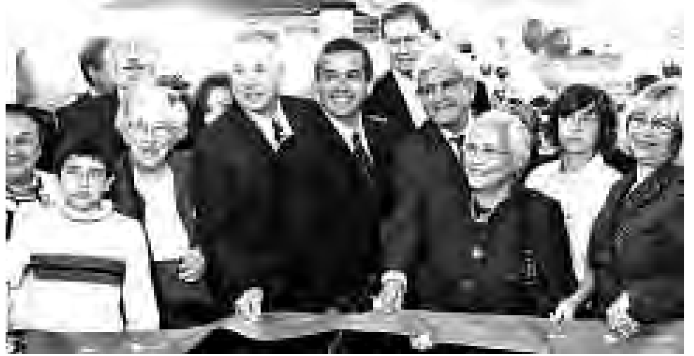
Mayor Antonio Villaraigosa cuts the ribbon.

The new branch is at 161 S. Gardner St. in the Fairfax district. It is one of the last libraries to open.