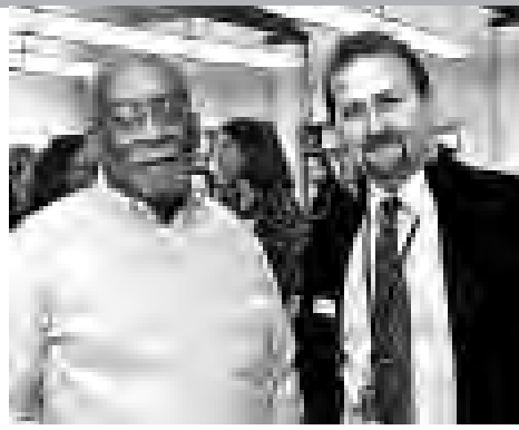
Two library staff members man the reference desk.