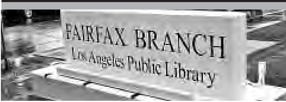
The Fairfax Branch Library.