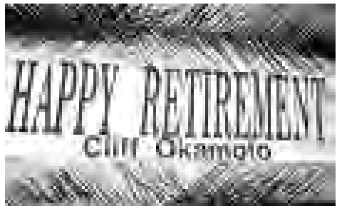
Welcome to the event.