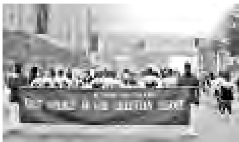
First Church of God Christian School.