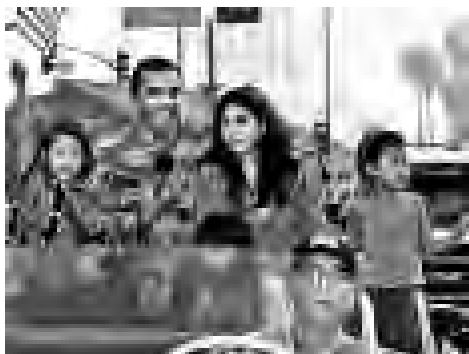
Mayor Antonio Villaraigosa greets the crowd.