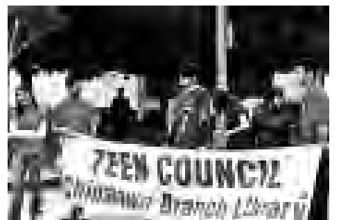
Chinatown Branch Library Youth Council.