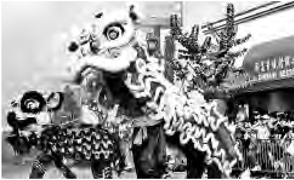
Lion dancers perform during the firecracker ceremony.