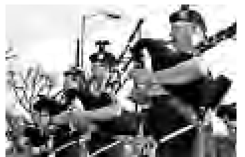
42nd Highlander Regimental Pipes and Drums.