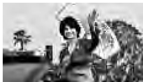
Congresswoman Lucille Roybal-Allard.