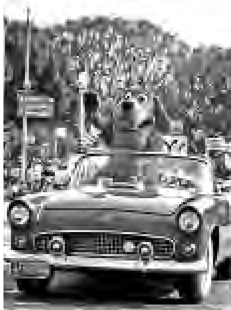
Clifford represents the "Year of the Dog."