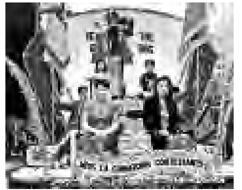
Miss LA Chinatown Contestants.

It is celebrated with colorful festivals, parades, and most importantly, large family gatherings. It is also a time when ancestors are fondly remembered and families give thanks for their blessings. Red pockets of money ("Lai See" or "Hung Bao") and firecrackers add fun and excitement to the Chinese New Year celebration.