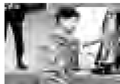
A child performing martial art moves.