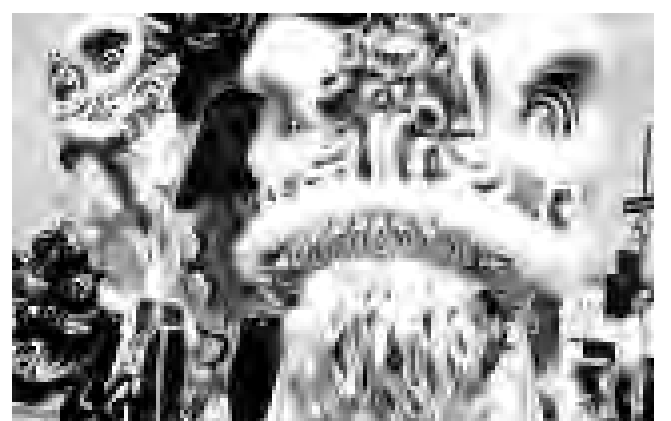
The Lion dancing team.