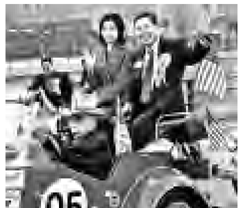
Mayor Peter Yao, City of Claremont.