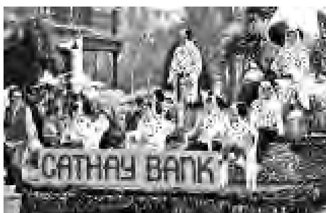
Cathay Bank represents the "Year of the Dog."