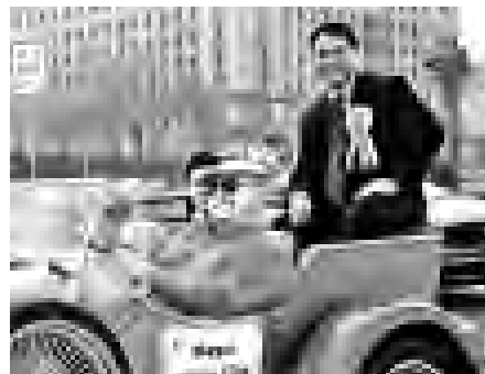
Mayor Mike Gin, City of Redondo Beach.