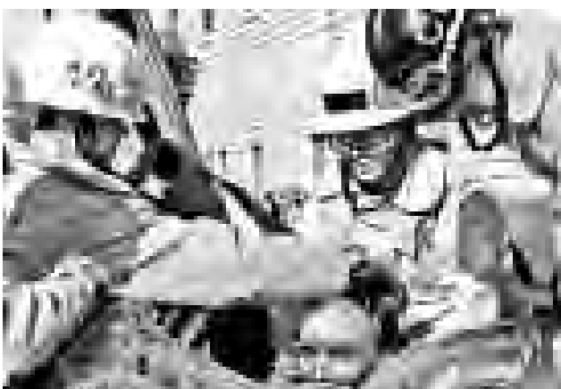
A Recruit learns how to remove an injured passenger from an accident.