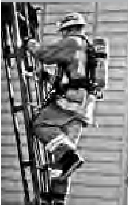
A Recruit climbs ladder to enter the training structure.