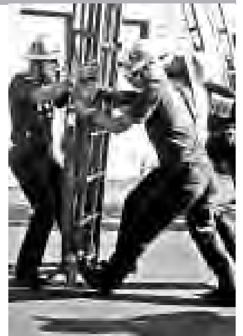
Recruits use teamwork to set up ladder.