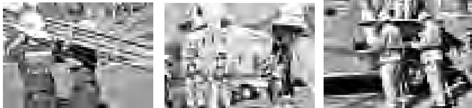
Recruit Wan carries ladder back from the training structure.