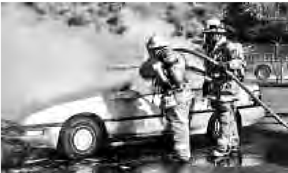
Recruit Reddick is learning the art of putting out a car fire.