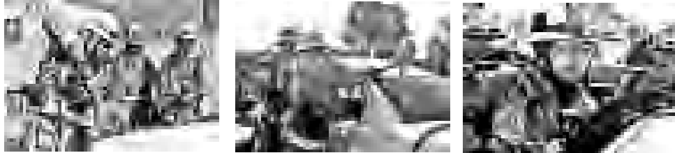
A Recruit learns how to use the saw to cut open a hood.