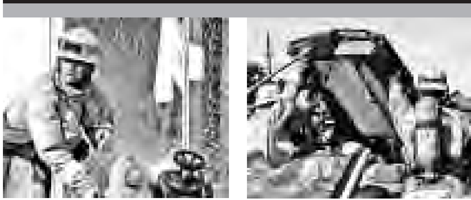
A Recruit checks to see that water is getting to the simulated fire.