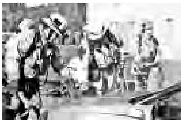
A Recruit practices cutting open the hood.