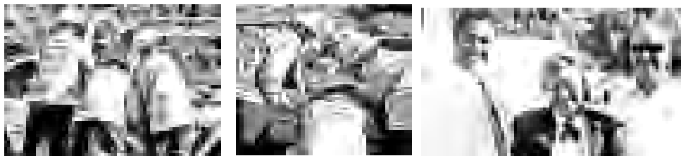
Rescuing an injured passenger is a delicate process.