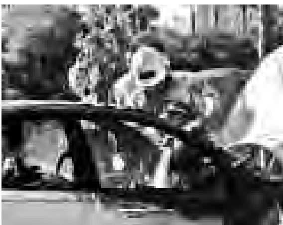
A Recruit hoses down the car.