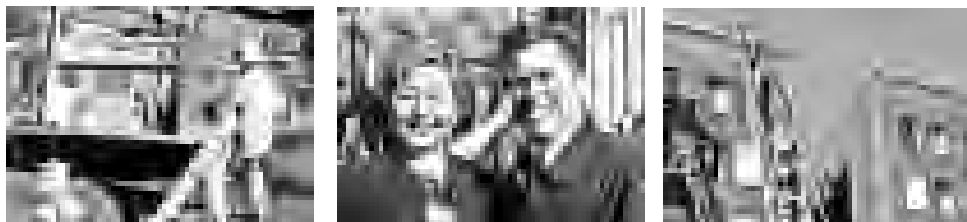
A Recruit gets the hose out of the fire engine.