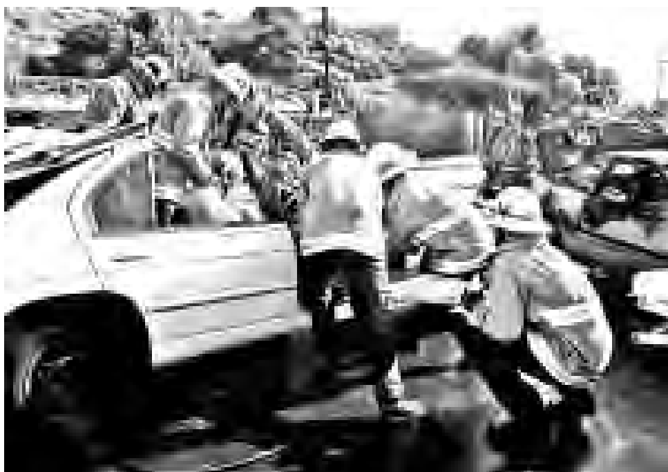
Recruits insert a stretcher into the vehicle to rescue the injured passenger