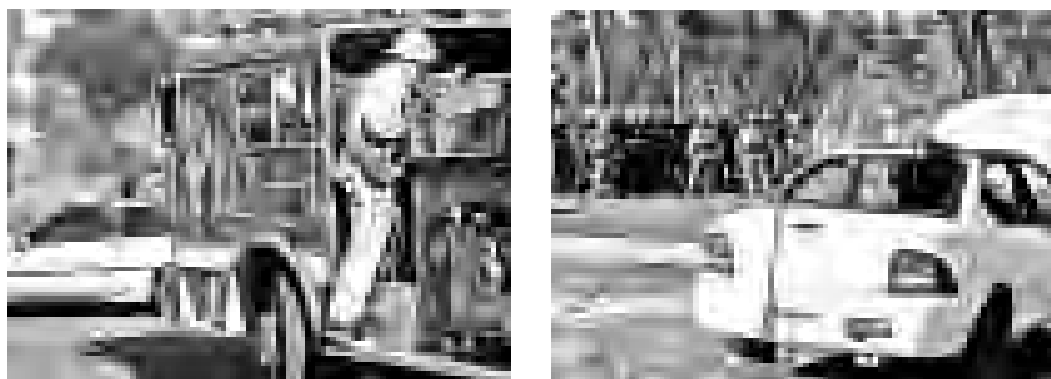
There's no time to waste when a car's on fire.