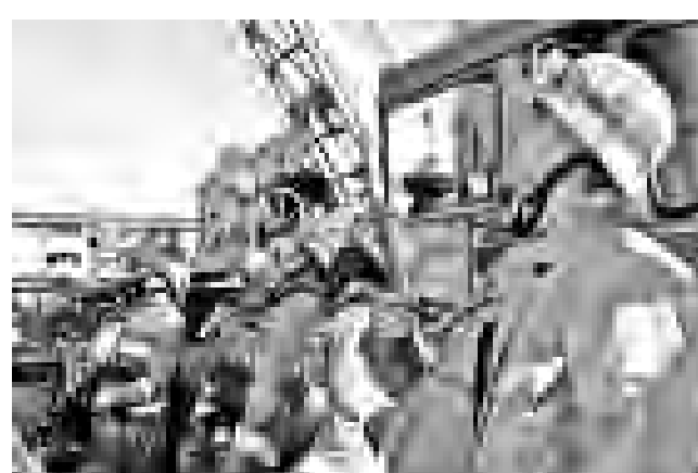
Recruits look up as other recruits climb to the top of the building.