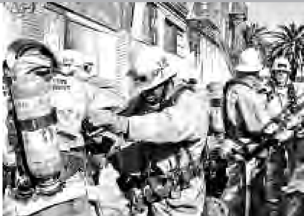
Fire Recruits help each other put on gear.