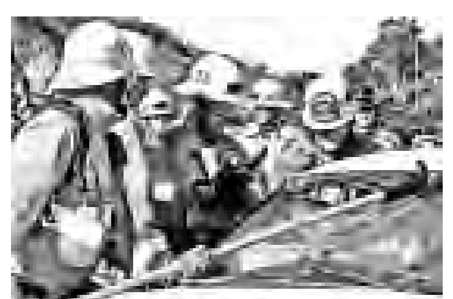
Recruits remove the windshield.