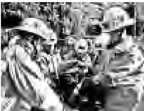
The injured passenger is rescued without further injuries.