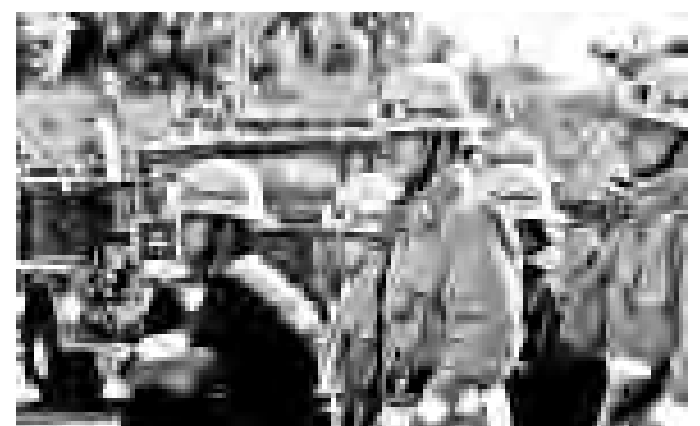
Recruits wait for their turn to practice on the burning vehicles.