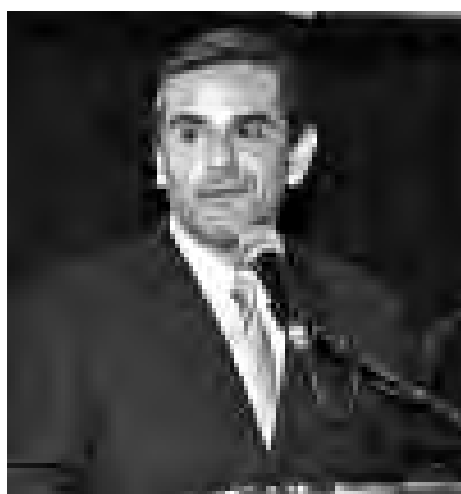
Mayor Antonio Villaraigosa.