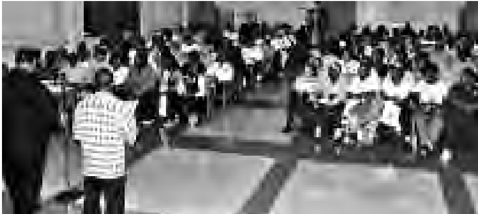
Southern Division Crossing Guards.