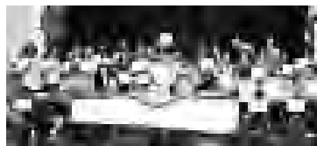
Valley Crossing Guards with perfect attendance.