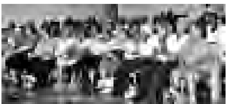
Valley Crossing Guards.