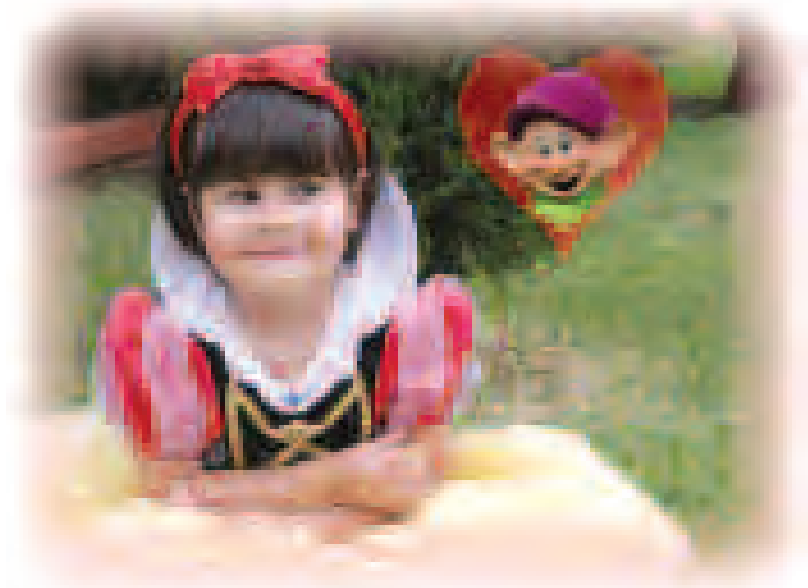
"My granddaughter was going to a Halloween costume party and she was nice enough to allow me to take a few pictures for about three minutes before she took off running to play. Thanks to the Canon SLR's fast response, I was able to capture the brief moment in time that children give you." (Exposure information: "Canon 20D, Sigma 18-125mm zoom lens @ 58mm. Exposure was 1/100 sec at f : 6.3, ISO 200, with an overcast sky. Effects were added with Photoshop Elements 2.")