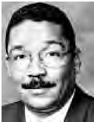
Herb Wesson, Councilman, District 10