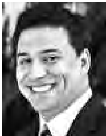
José Huizar, Councilman, District 14