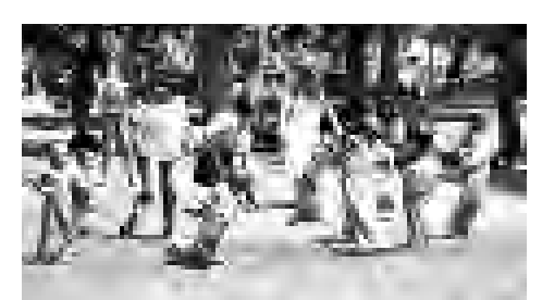
A tumble to the finish line.