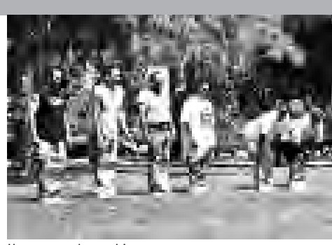
Hey guys ... hop to it!