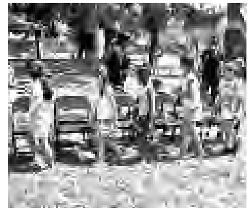
Picnic-goers play a children's version of usical chairs.