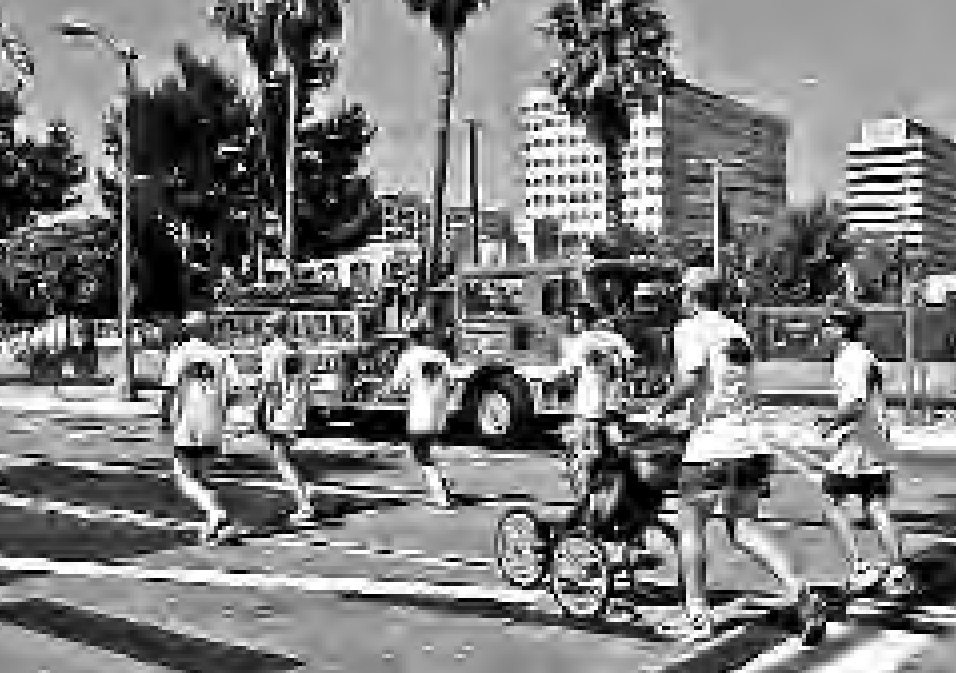
Runners during the Memorial Relay.