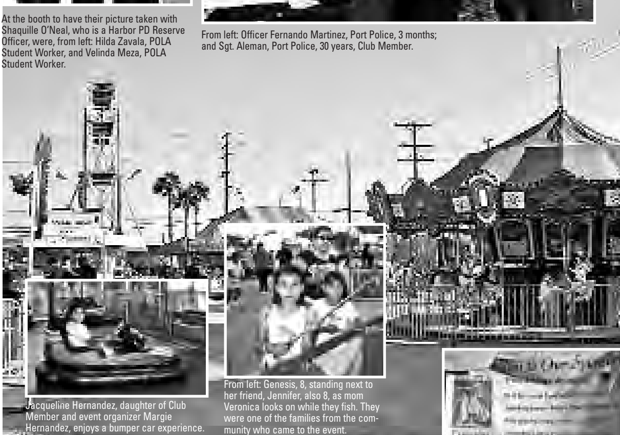
This merry-go-round was one of the many rides available.